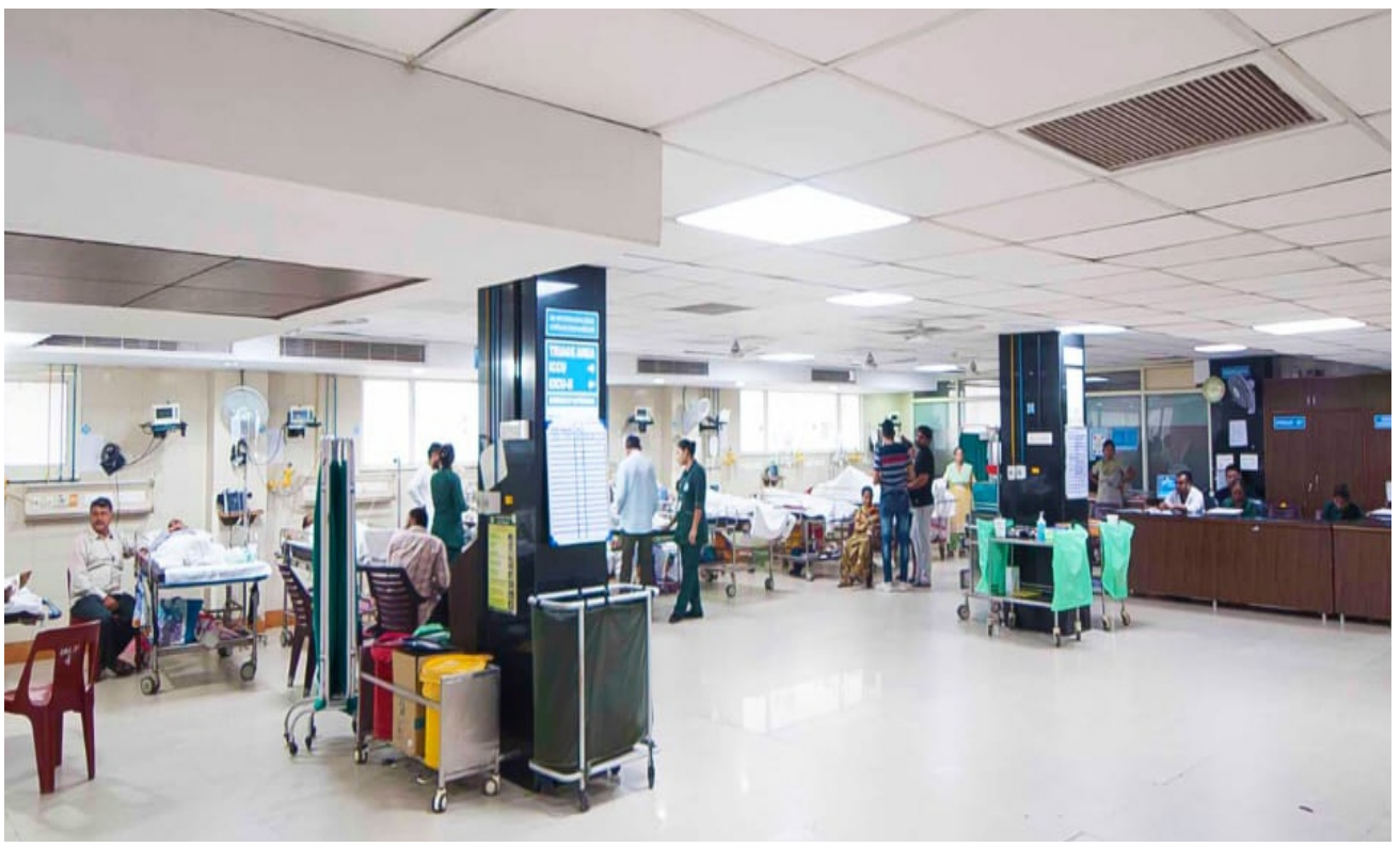
DMC&H EMERGENCY BLOCK