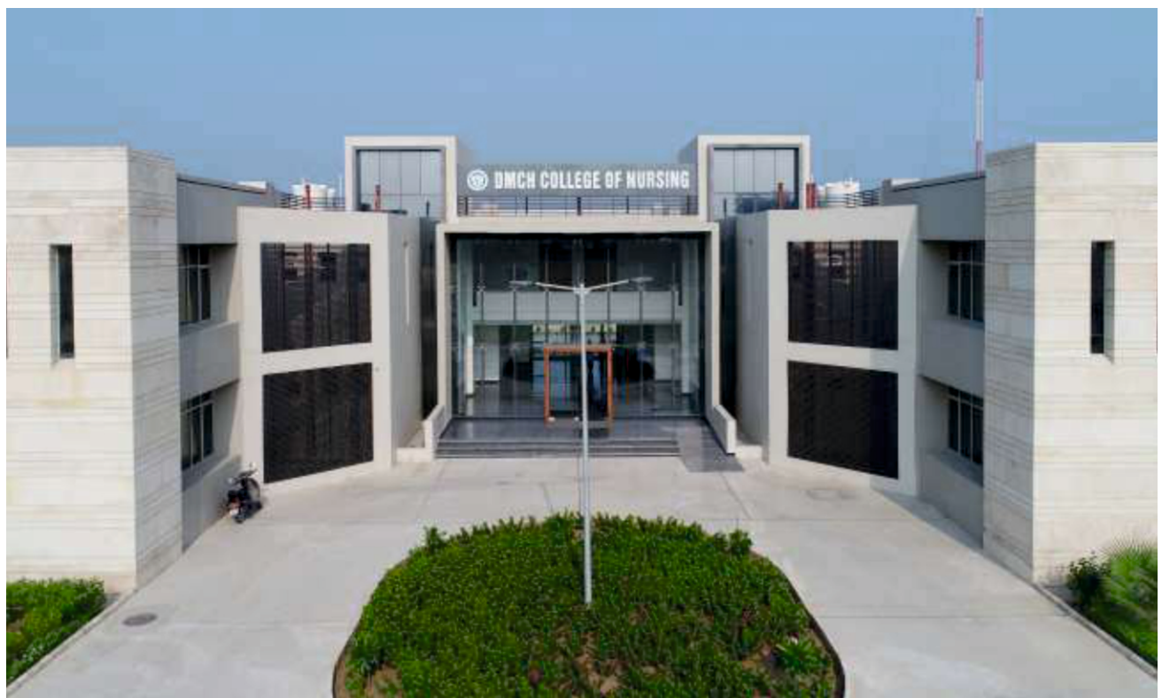
DMC&H COLLEGE OF NURSING