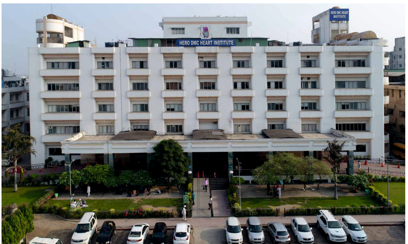
UNIT-HERO DMC HEART INSTITUTE